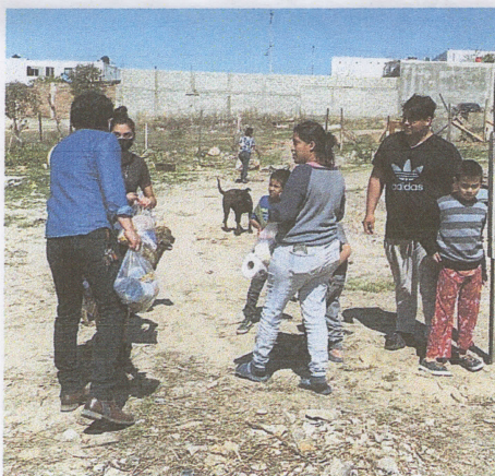
Many Need Home Oxygen