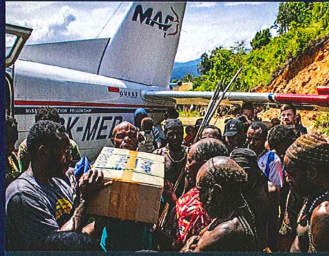
Moi villagers help unload the boxes of New Testaments from the MAF airplane